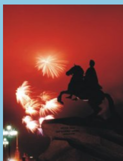
Peter the Great, Founder of St.Petersburg

“Liebe Extra-Class-Team, Vielen Dank fuer die wunderbare Zeit; ihr seit die beste Sprachschule die ich kenne! Alles Gute fuer die Zukunft!”